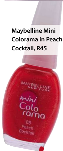
Maybelline Mini Colorama in Peach Cocktail, R45