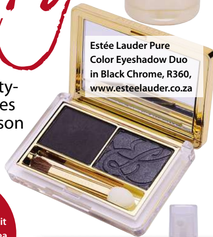
Estée Lauder Pure Color Eyeshadow Duo in Black Chrome, R360, www.esteelauder.co.za