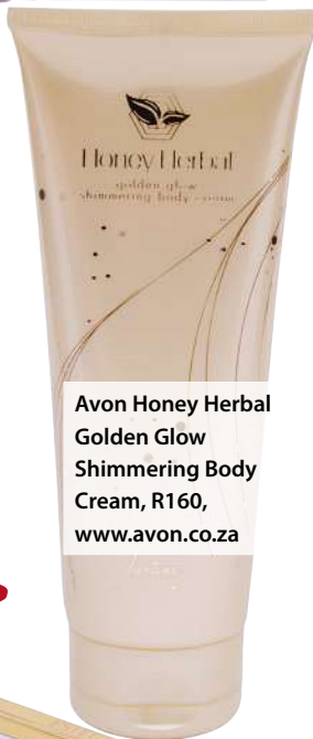
Avon Honey Herbal Golden Glow Shimmering Body Cream, R160, www.avon.co.za