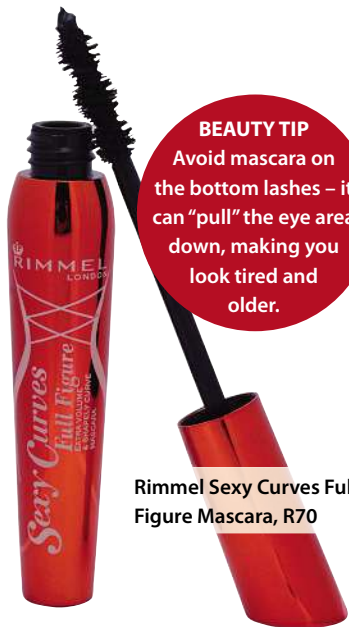
Rimmel Sexy Curves Full Figure Mascara, R70

These are my booty-shaking must-haves for the festive season