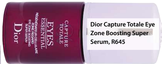
Dior Capture Totale Eye Zone Boosting Super Serum, R645